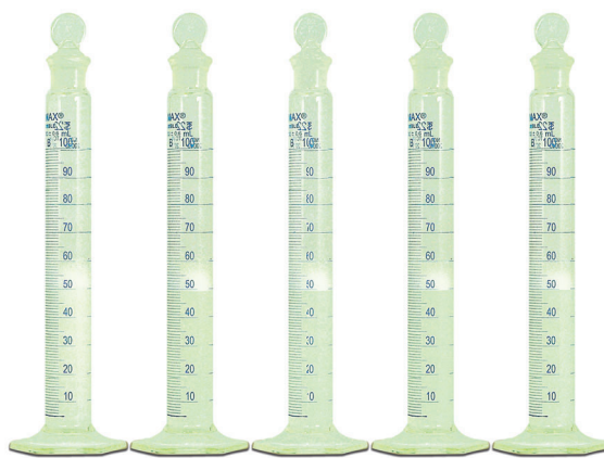
Immediate 1 Minute 3 Minutes 5 Minutes 10 Minutes